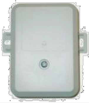
FIGURE 6. Surge Suppressor