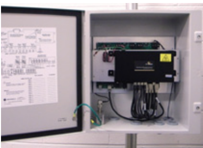
FIGURE 2. The CMM4 Includes 14 Port Ethernet Switch, GPS Antenna and Cables

The Cluster Management Module 3 (CMM3), also known as the CMMmicro, allows network operators to reduce the time and labor cost of system installation and maintenance in AP Clusters. This management module reduces cabling between system modules and provides reliable network synchronization. There is only one cable going from the CMM3 to each module carrying the Ethernet connection, synchronization pulse and GPS data.