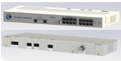
FIGURE 3. The Rack-Mounted Cluster Management Module 4

The cluster management module (CMM) is the heart of the Cambium system's synchronization capability, which allows network operators to reuse frequencies and add capacity while ensuring consistency in the quality of service to customers. For operators who prefer indoor CMM mounting, Cambium offers the Rack-Mounted Cluster Management Module 4. The unit is designed to be mounted onto a standard 19-inch telecommunications rack and to allow the Cambium CMM4 to be collocated with other telecommunications equipment.