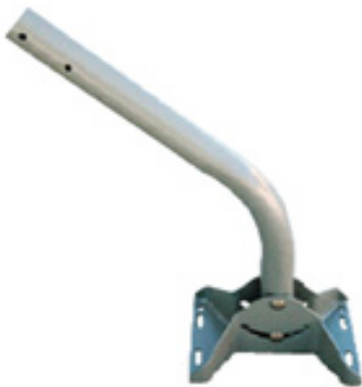
FIGURE 8. The SMMB2 Mounting Bracket