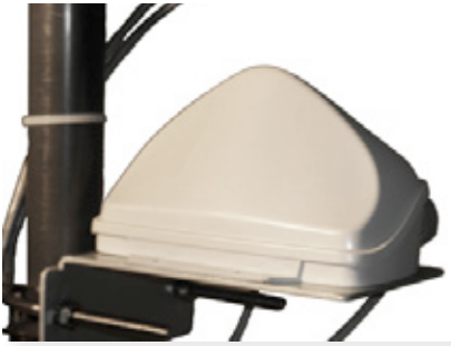
FIGURE 4. The Universal GPS (UGPS)