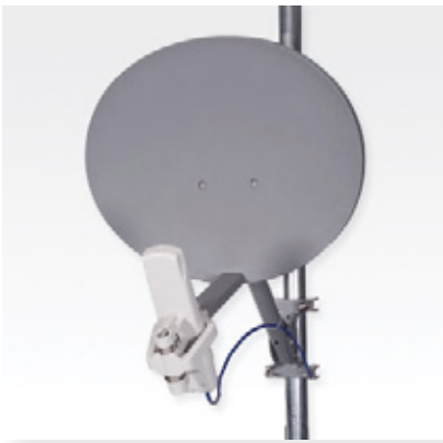
FIGURE 10. The 27RD Passive Reflector